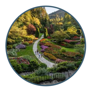
The Butchart Gardens

Welcome to Victoria! As you prepare for our convention, we encourage you to explore the many wonderful attractions and activities Victoria has to offer. Whether you're attending the convention alone or bringing your family, Victoria is full of experiences that will make your stay unforgettable.