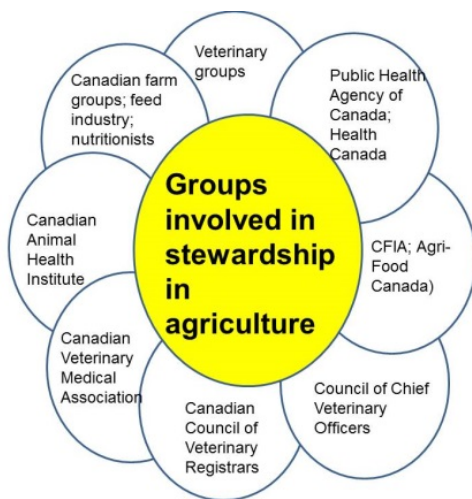
Figure 2. Groups involved in antimicrobial stewardship in agriculture

The pan-Canadian Framework for Action is setting the scene for development of a pan-Canadian Action plan to take a One Health approach to AMR. The draft pan-Canadian Framework has yet (August 2017) to be ratified by all the provincial Ministers of Agriculture, the step required for development of an Action Plan. There are numerous issues to resolve, including the pan-Canadian leadership: Who do you phone to find out what's happening or to discuss issues? Who's monitoring and reporting AMR and AMU, and to whom? How will antimicrobials be distributed to farms and farmers? Who's monitoring appropriate use, and benchmarks against which possible AMU and AMR problems can be identified? Figure 2 shows the many groups involved, and the complexity of the integration process that will be required for an effective pan-Canadian approach in addressing AMR that meets international standards.